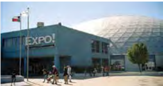
Expo Center in Belton, Texas. Map on page 3.